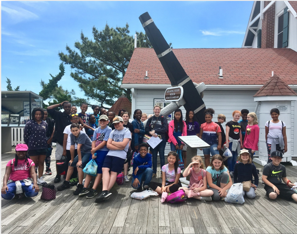
Pocomoke Middle School enjoyed a field trip to the Museum on May 22, 2019