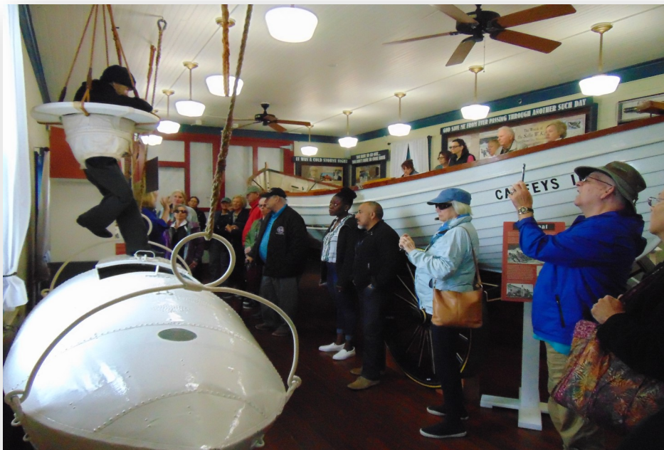
A tour group from the Harrison Group gets an orientation in the Boat Room