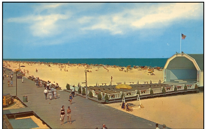
Bandstand on the beach at Somerset Street, circa 1960