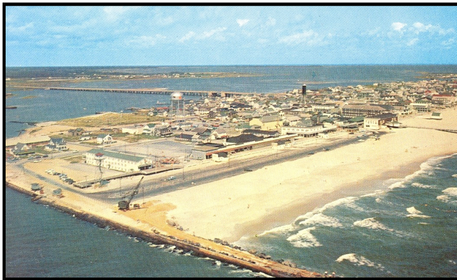
The Inlet Parking Lot, looking northwest, circa 1955

The parking fee, collected by lot attendants, was 25 cents per day. The lot was an immediate success, prompting the town to widen it to 100 feet in 1953 and install parking meters. Naturally, the parking fee was raised as well. The rate was increased to 25 cents an hour, or for $1 you could park for up to 12 hours. The lot has been expanded further since 1953 to where it now can accommodate 1,200 cars and also serve as a venue for major events such as SpringFest and SunFest. The parking meters were removed in 2000 and replaced with a ticketing system. Each parking space contributes an average of $2,000 annually to the town budget.