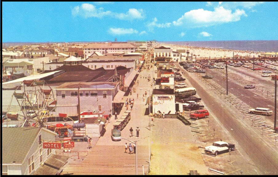
Aerial photograph looking north from the Coast Guard tower on the boardwalk at South 2nd Street , circa 1965

The Trimper family erected two buildings on the east side of the Boardwalk between South 1 st Street and South Division Street opposite their amusements around 1916. The buildings were reportedly used for storage at that time. Later on, various games and boardwalk treats were purveyed at those locations.