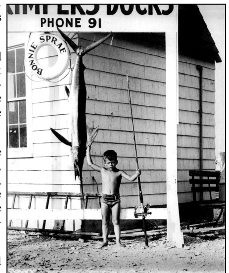
A young Dan Trimper IV poses for a memorable photograph at Trimper's Docks circa 1938.