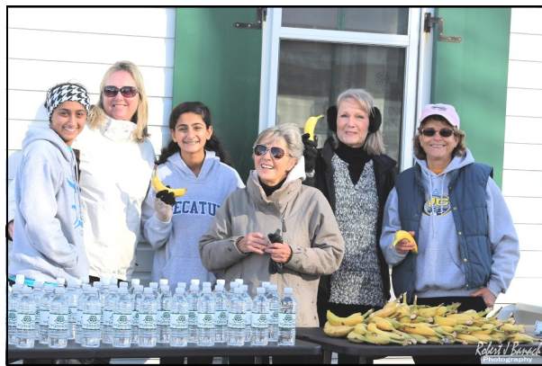
Volunteers from Stephen Decatur High School join O.C. Museum members to offer refreshments to the runners.