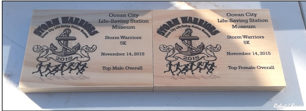
Trophies were produced by Plak That of Ocean City