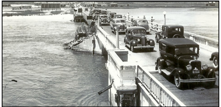
View looking west of the first automobile bridge into Ocean City, dated 1938. At the time this picture was taken, plans were already well developed for the "new bridge" at North Division Street that opened in 1942.

This is especially true on special days like Tuesdays, Thursdays and Sundays, when extra trains come in and thousands of people from the country come in vehicles and automobiles to spend the day. It is not uncommon for from 500 to 1,000 automobiles per day to pass over the road from Berlin to Ocean City, a distance of seven miles, the point where Virginia, Delaware and Maryland people come together.