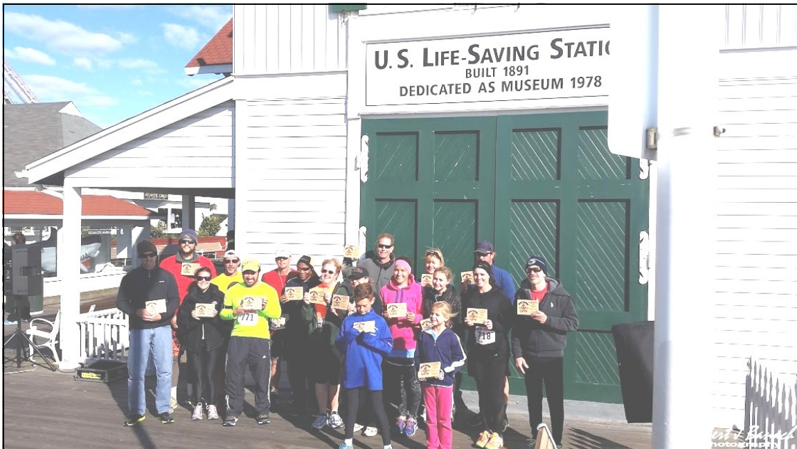
Many of the winners pose in front of the Museum with their trophies