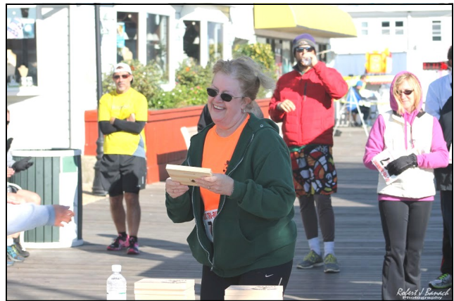
This participant is delighted with her award