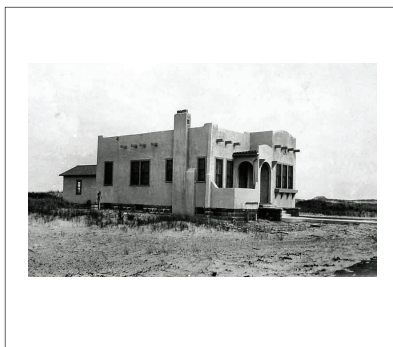
“Ocean City, MD 1928”

When labeling photographs, never use a ballpoint pen or other implement that could cause an indent in the paper. I recommend an ultra fine Sharpie or other felt tipped photo-marking pen or a No. 2 pencil for older photographs printed on non-coated photographic paper.