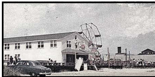
The Inlet Lodge circa 1950

out of how excited all the kids would be, and take notice of their parents as they would watch their children with that faraway look in their eyes as they remembered their own happy summers at the ocean.