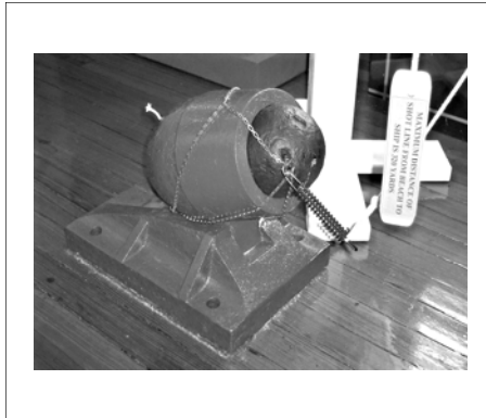
Manby Line Throwing Gun on display in the Boat Room of the Museum