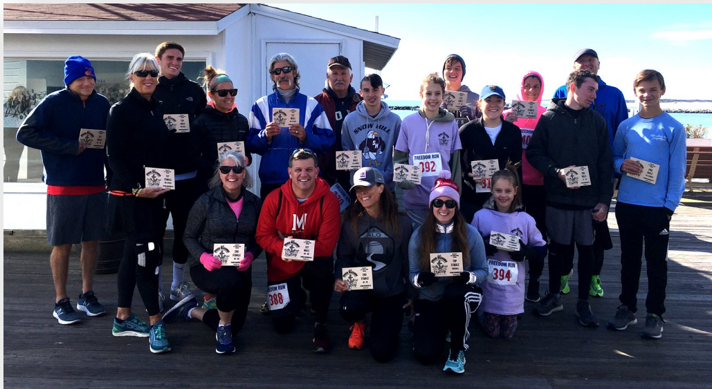
Winners of the 6th Annual Storm Warrior 5K pose with their awards