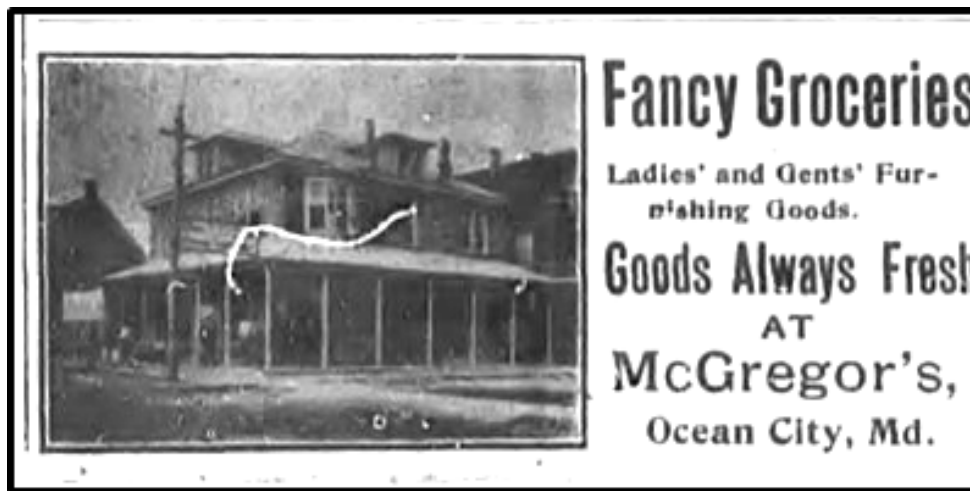
Figure 1: The McGregor Building in Ocean City. The Berlin Advance , July 28, 1911.