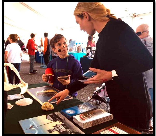
Interested visitors stopped by our table at Harbor Days at the Docks on October 19, 2019