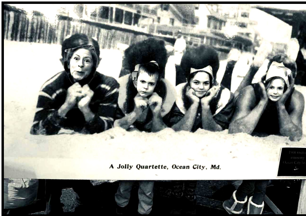
Our Winterfest display featured an enlarged vintage postcard with cut outs for making fun holiday portraits