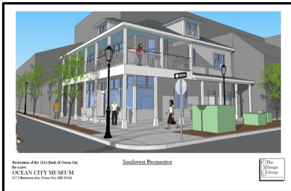
Figure 4: Architect's rendering of the restored Bank of Ocean City building.