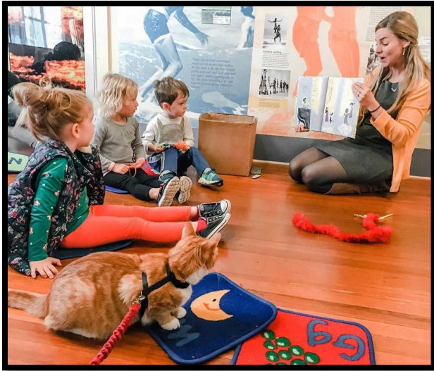
Pip the Beach Cat was a special guest during our Little Learners Program on October 28, 2019