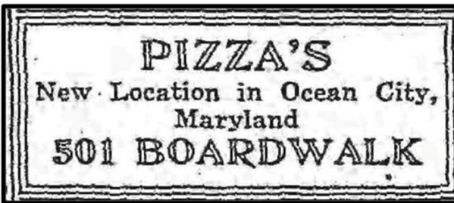
The Baltimore Sun, June 25, 1955