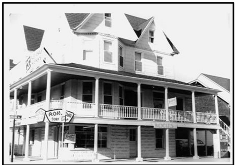
Another view of the former "Scott House" taken in 1966.