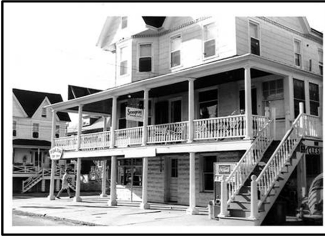
The former "Scott House" as it appeared in 1966, viewed from Caroline Street.